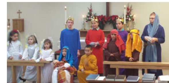
Pictured are participants of the Children's Christmas Pageant at the Christmas Day service.