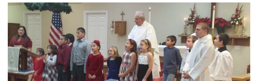
Another Children's Christmas Pageant was performed at the Christmas Eve service.